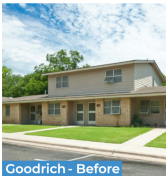
Goodrich - Before

HACA continues building for the future with the completely rebuilt Goodrich Place in the desirable Zilker neighborhood. Goodrich was originally a 40 unit housing project, but when Goodrich reopens in April 2020, there will be 120 units of affordable housing available in a very high-opportunity area.