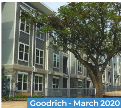
Goodrich - March 2020