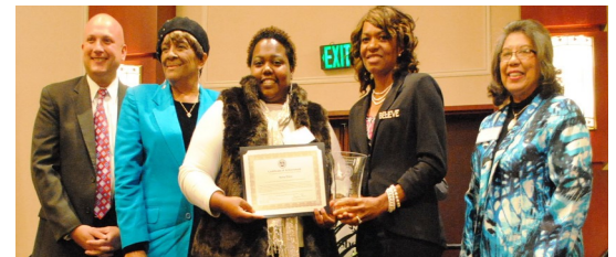
FSS Program Graduate

The Family Self-Sufficiency (FSS) Program provides opportunities to residents of the Public Housing and Housing Choice Voucher Programs to achieve economic independence. A five-year plan will identify the participants' personal and professional goals, including the added feature of an escrow savings account.