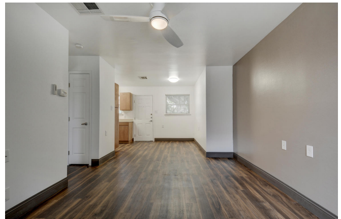
During the RAD process, many units will receive upgrades like new floors, doors, kitchens, paint and ceiling fans.

to live at the specific properties of their choice, rather than being placed in the first available unit. Residents who remain in one RAD property for two years will be able to apply for a Housing Choice Voucher that will allow them to seek housing in the private rental market.