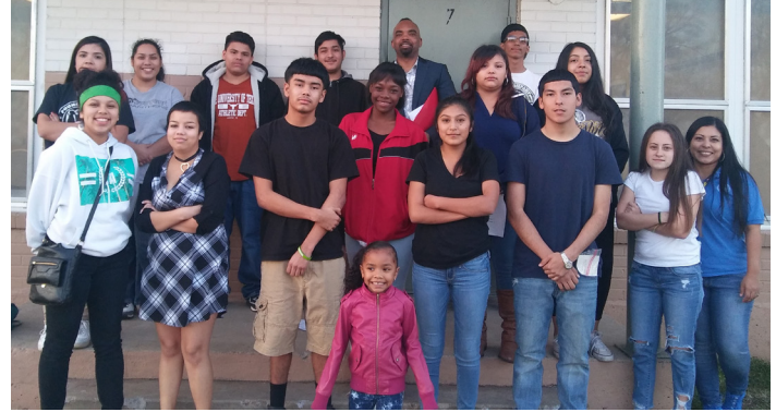
HACA teens recently attended a Summer Youth Employment Information session at BTW to learn skills including professionalism, time management, and communication, that they can use while working over the summer.