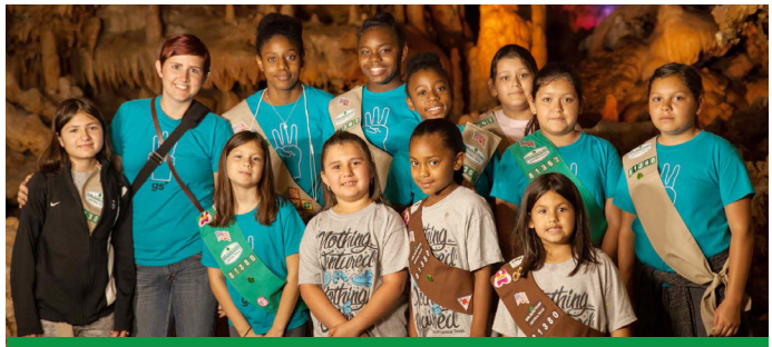
The Girl Scouts from Shadowbend & Georgian Manor used the money they earned from selling Girl Scout cookies to go on a private tour of Inner Space Caverns in Georgetown, Texas.

Scouting builds character, confidence and helps prepare children to become responsible citizens and leaders. Girl Scouts is open to all girls, grades K-12. During troop meetings, the girls may play games, cook, make crafts, do STEM activities, learn life skills, and sell cookies. Girl Scouts of Central Texas serves HACA youth from Georgian Manor, Santa Rita Courts, Shadowbend, Manchaca Village, Booker T. Washington Terraces, Rosewood Courts, and Northgate. The Boy Scouts meet at Georgian Manor, Santa Rita and Booker T. Washington. If your child is interested in adventure and fun, contact your ROSS specialist to find out how he or she can join the Boy Scouts of America or Girl Scouts of Central Texas.