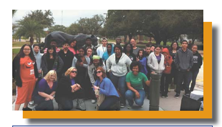
Y.E.S. to College Tour