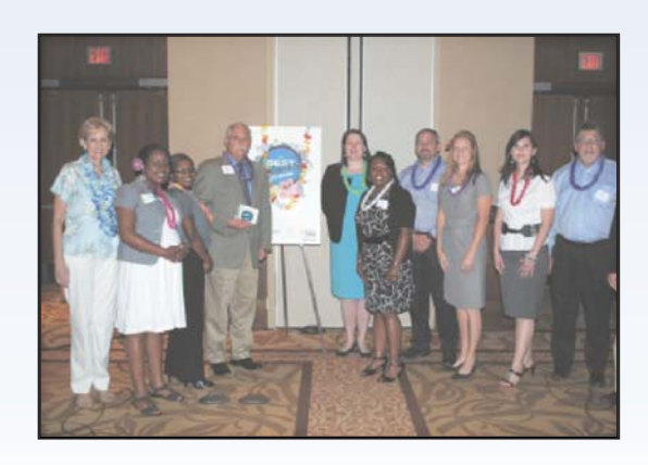
HACA honored as one of Austin Business Journal's Best Places to Work

HACA's new website was introduced in July 2011. It was redesigned to be more informative and user-friendly for our residents, staff, and the public.