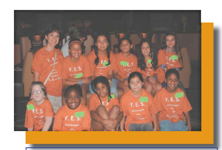
Youth Educational Success (YES) Program students at the Main Event Entertainment Complex

By working hard and attending school, this fun program highlights HACA student success. Parents encourage their children to earn good grades and to never miss a day of class so they may realize the importance of doing well in school.