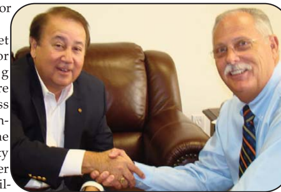
HACA and the Greater Austin Hispanic Chamber of Commerce partner to create Emerging Enterprises.

The target markets for Emerging Enterprises are small business owners of all ethnicities and the Housing Authority residents, however the center is available to anyone in the Greater Austin Area.