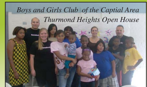
Boys and Girls Club of the Capital Area Thurmond Heights Open House

Boys and Girls Club of the Capital Area (BGCCA) is now on-site at Thurmond Heights and Chalmers Courts Apartments. Youth from Thurmond Heights, Chalmers Courts, and the surrounding neighborhoods, ages 6 to 18 years old are eligible to participate. Both clubs will be open Monday through Friday 3:00 p.m. to 8:00 p.m. Dinner will be provided Tuesday through Thursday for all participating members. The clubs will provide daily activities including homework help, recreation, sports and more. Youth must register for membership with their parents permission.