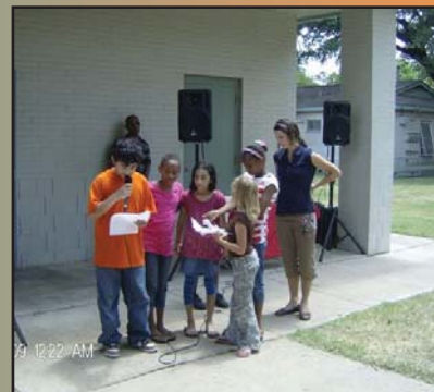
Children present the history of Juneteenth at Santa Rita's Juneteenth celebration.

HACA partnered with the AAUL and participated in sponsoring the scholarships as part of the agency's vision to dedicate ourselves to creating and sustaining healthy communities that promote individual responsibility, economic growth, human dignity, and hope for the future.