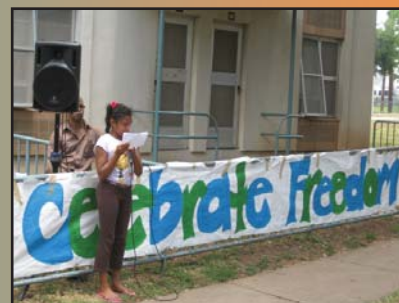
Youth presenter reads a poem at the Chalmers Courts' Juneteenth celebration.