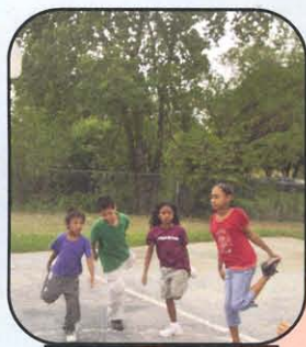
Thurmond Heights youth prepare for the Born to Run Race

Last month HACA youth participated in the Texas Round-Up Walk/Run held on April 27th. All participants received free running shoes as well. The Texas Round-Up is a statewide initiative that strives to improve the health of Texans through education and promotion of physical activity and healthy living.