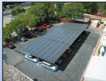
North Loop Solar Panels